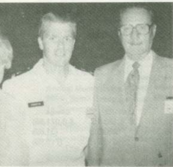
and his wife, with their Naval Cadet grandson Banquet.