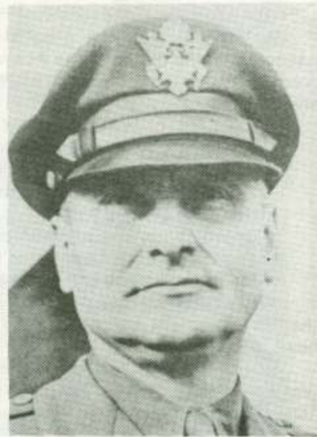
B/Gen Ira Eaker during a visit to Thurleigh in 1943.

From then until the early 1980s, he pursued a career in business and journalism that was an extension of his military career. From 1947 to 1957, he was a vice president of the Hughes Tool Co. in California with special responsibility for its subsidiary, the Hughes Aircraft Co. He then became a vice president of the Douglas Aircraft Co. and returned to Washington. He also wrote a