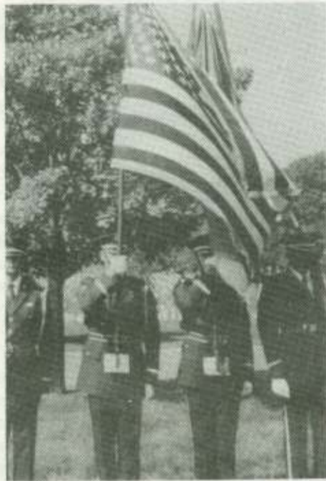
Color guard at Arlington Cemetery.