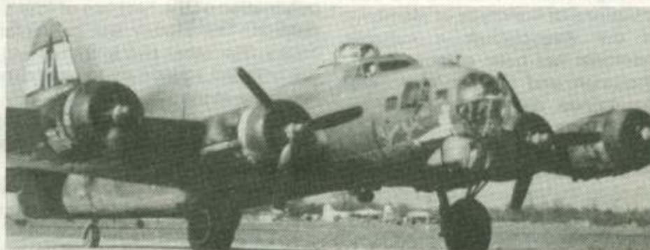
Satan's Lady taxis in at the end of another mission.